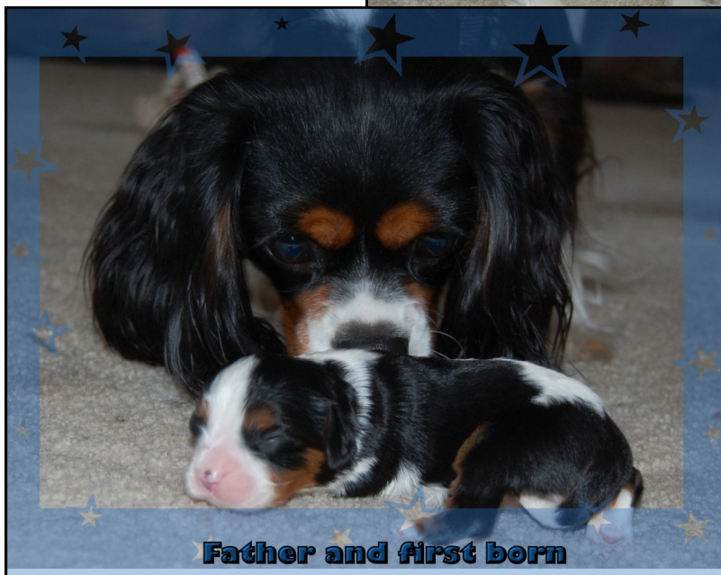
Father and first born